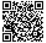
Bulletin QR Code