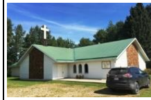
Evergreen - Jesuit Martyrs

Rocky Mountain House - St. Matthew Church Caroline - St. Joseph the Workman Church Evergreen - Jesuit Martyrs Church